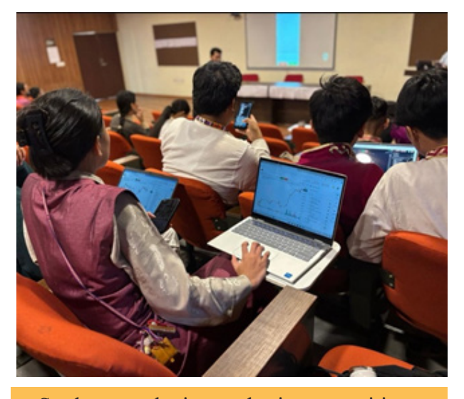
Students analyzing trades in competition.

markets, and the intricacies of market movements.