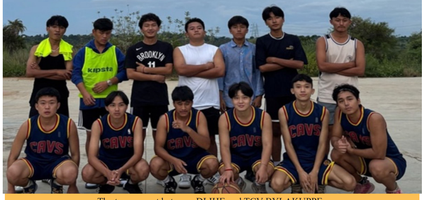
The tournament between DLIHE and TCV BYLAKUPPE

The campus tour successfully achieved its objectives, fostering meaningful connections and sparking academic interest among the visiting students. DLIHE looks forward to future collaborations with Bylakuppe, further enhancing educational opportunities for all involved.