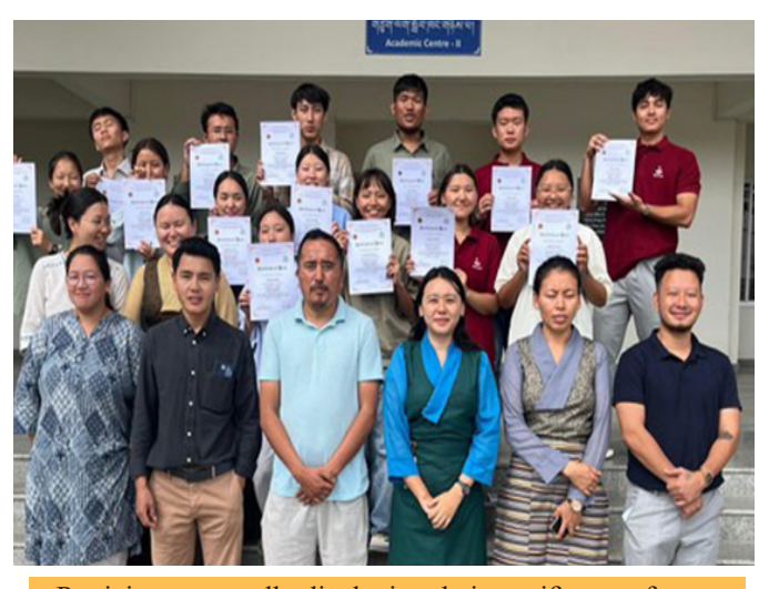
Participants proudly displaying their certificates after completing the Tally Certification Course.

reers in accounting and business management.